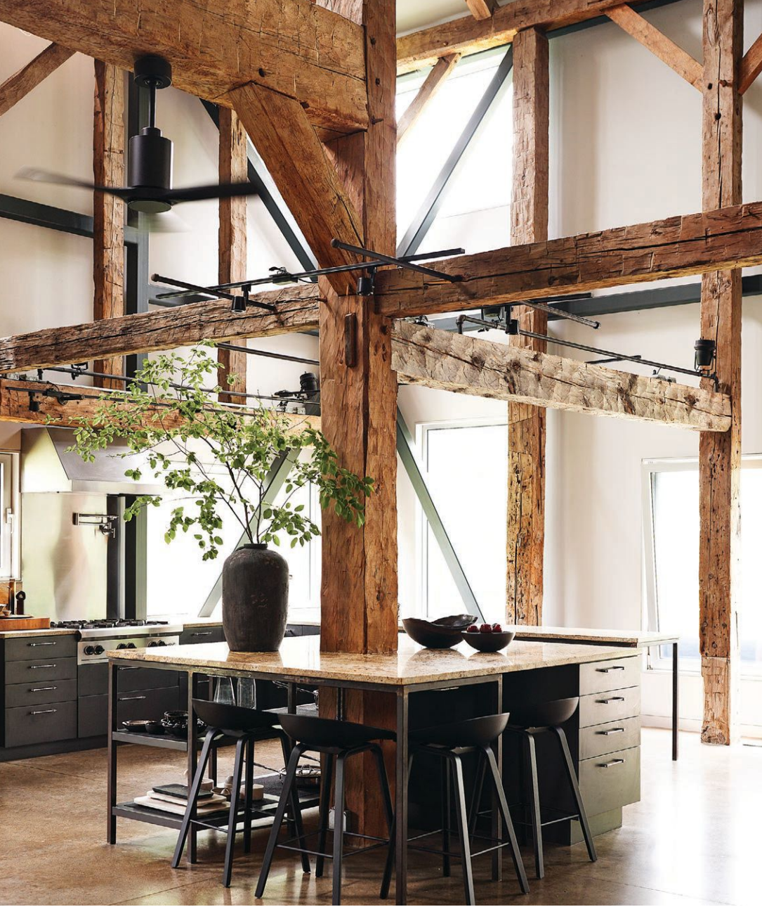
Clockwise from top: Wooden beams create an industrial, rustic aesthetic; Wolf appliances in the kitchen; Mikael Kenta's "Jesus" (2017) hangs behind May Furniture's Sunday table; accent table from Gestalt New York.